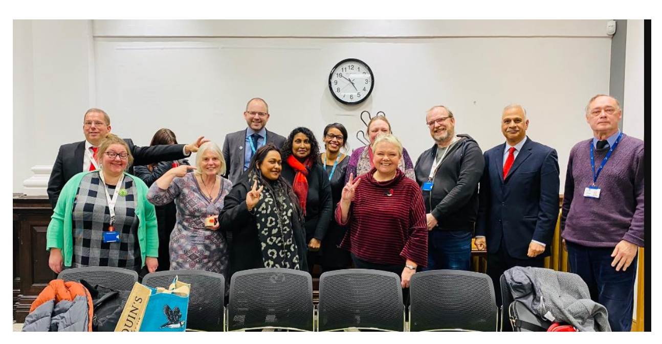
The House Project at the Education and Children's Services Scrutiny Board

The City of Culture presented many exciting opportunities for Coventry. Unfortunately, the City of Culture Trust entered in administration in February 2023 before it was able to complete delivery of its legacy plan and Finance and Corporate Services Scrutiny Board (1) met to ask questions about its legacy. The Board requested an additional meeting to look at the issue specifically. Although only one former trustee was able to attend a meeting, the Board considered the background and context of a loan from the Council to the City of Culture Trust. Members of the Board questioned Cabinet Members as well as officers. An independent review of collapse of the Trust has been requested and the outcome will be reported to scrutiny in due course. The Board however welcomed the work being done to continue working in partnership to continue the legacy of the City of Culture year.